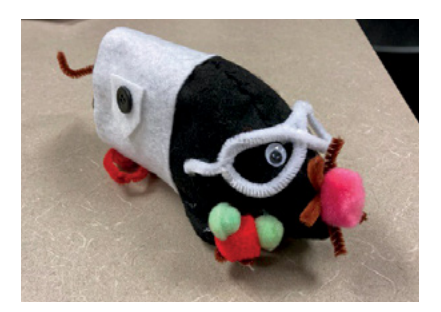
Making felt 'moles'