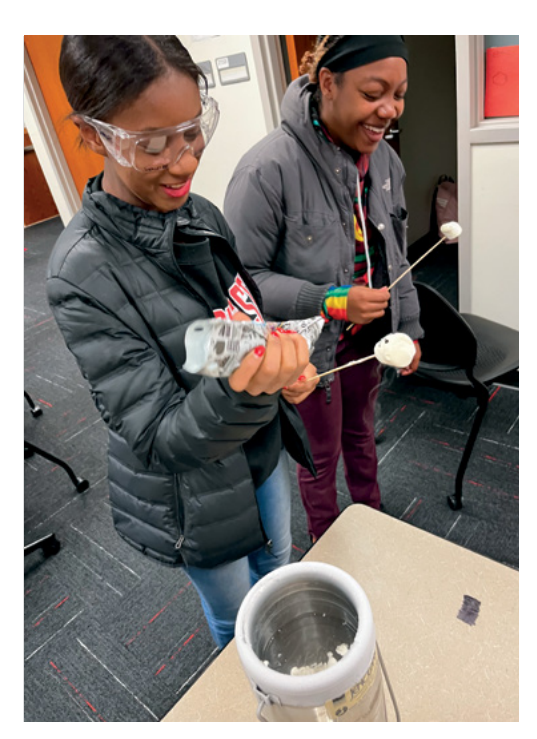
Making marshmallow ghosts